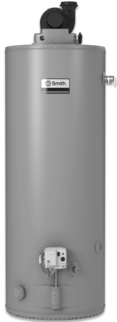
BTF-80 SERIES 210/211

For complete warranty information, consult written warranty or contact A. O. Smith